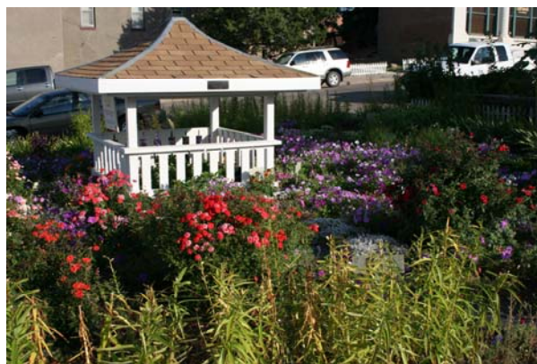
Bell Tower Garden on Pierre Street