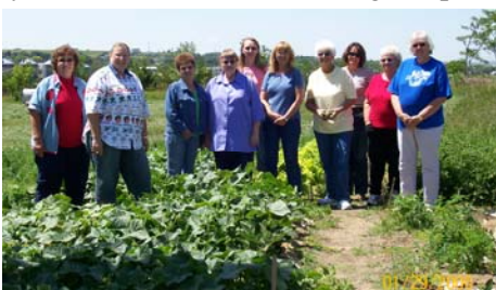
Winner Community Gardens