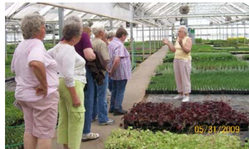
Bluebird Nursery Tour