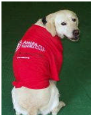
Dakota's Jake II – Rapid City RDO Day official mascot

dog! The Region 4-H Dog Project joins Rapid City Kennel Club again this year in promoting Responsible Dog Ownership on Saturday, July 12 th . Last year, the clubs received National recognition from AKC for holding this event, they were one of the top 3 out of over 350 clubs! Join us for a fun day with your family and dog!