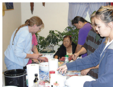
Slow Cooked Meals Slow-Cooked Meals, held at Oglala Lakota College in Martin, demonstrated the ease and convenience of nutritious meals using a slow cooker. 12 participants made beef stew, with beef paid for by South Dakota Beef Council grant.