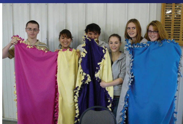
Custer County Jr. Leaders tie fleece blankets for the Operation Military Kids project.

OMK is an ongoing, dynamic program to support and promote the children of deployed military service professionals. OMK is a collaborative effort between the U.S. Army, South Dakota 4-H, the American Legion, and the Boys and Girls Clubs of America. Its purpose is to provide local community support for the children of service women and men from South Dakota. The South Dakota Cooperative Extension Service administers the program and its offices are located at South Dakota State University's West River Agricultural Center in Rapid City.