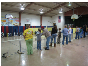
4-H Shooting Sports Bennett County 4-H Shooting Sports grows with 34 Archers, and 28 BB participants.

SD Highway Patrol offered a popular station to combat distracted driving.